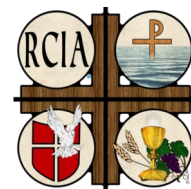
Rite of Christian Initiation for Adults