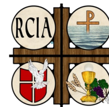
Rite of Christian Initiation for Adults