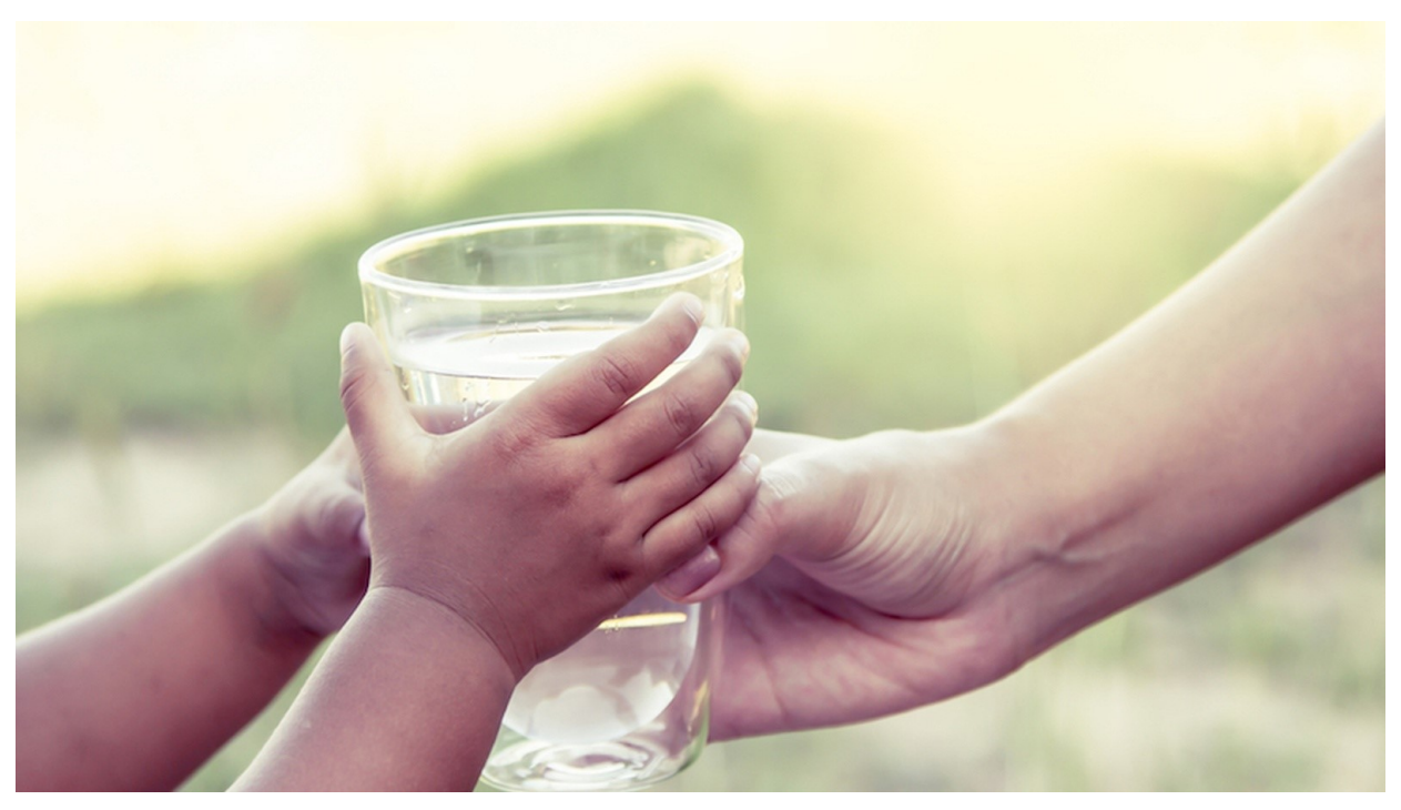
Thirteenth Sunday in Ordinary Time July 2, 2023